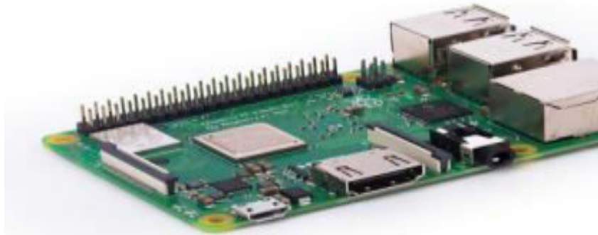
Figure 1-RASPBERRY-PI 3-MODEL B+

The Raspberry Pi 3 Model B+ is the latest product in the Raspberry Pi 3 range, boasting a 64- bit quad core processor running at 1.4GHz, dual-band 2.4GHzand 5GHz wireless LAN, Bluetooth 4.2/BLE, faster Ethernet, and PoE capability via a separate PoE HAT. The dual-band wireless LAN comes with modular compliance certification, allowing the board to be designed into end products with significantly reduced wireless AN compliance testing, improving both cost and time to market. The Raspberry Pi 3 Model B+ maintains the same mechanical footprint as both the Raspberry Pi 2 Model B and the Raspberry Pi 3 Model B.