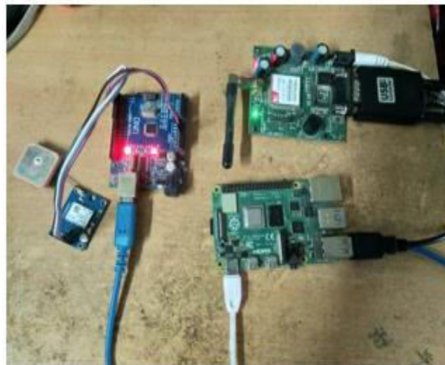
Figure 3-IOT Based circuit

The main working is based on UART (Universal Asynchronous Receiver & Transmitter) serial communication. Here data is transmitted asynchronously. UART is a serial communication device & it sends and receives data in parallel manner but internal it converts into serial. UART acts as a bridge between serial communication port and processor. On